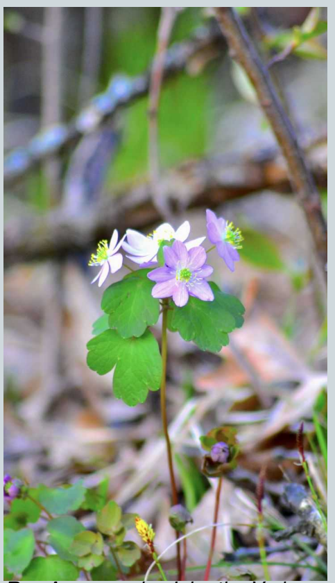
Rue Anemone