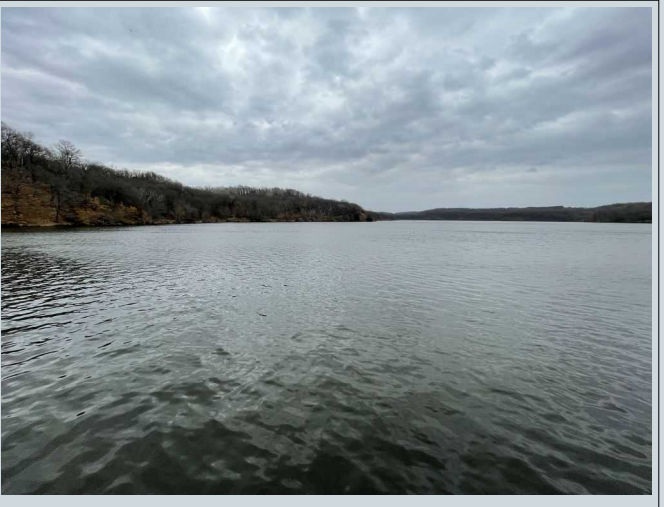
Willow River State Park, Wisconsin