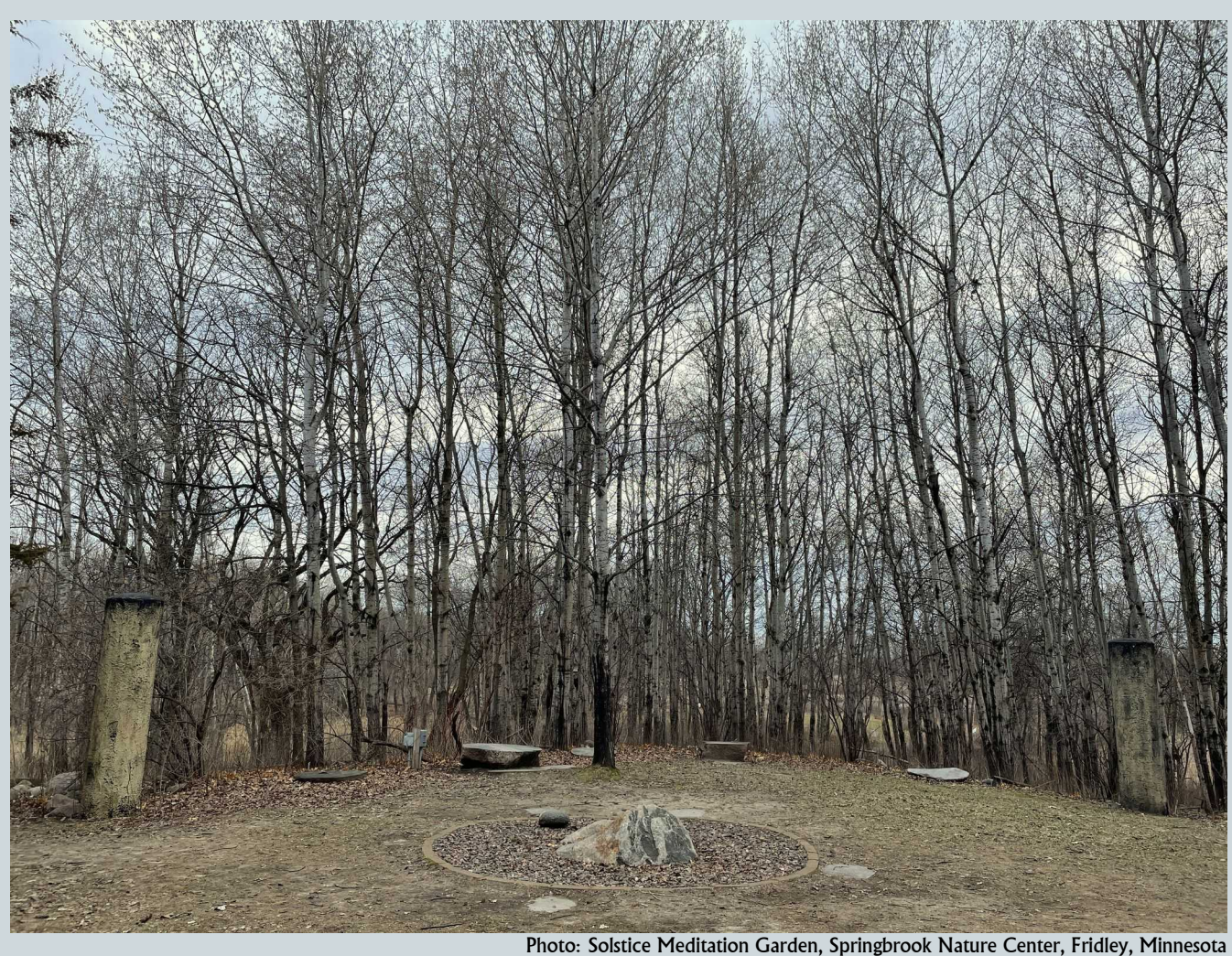
Photo: Solstice Meditation Garden, Springbrook Nature Center, Fridley, Minnesota The Northern Pin Oak behind the left column has finally dropped its marcescent leaves.