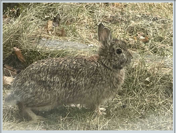
The actual Ostara Bunny, in the rain