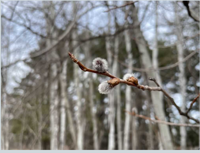
Aspen catkins, Oakdale Nature Preserve