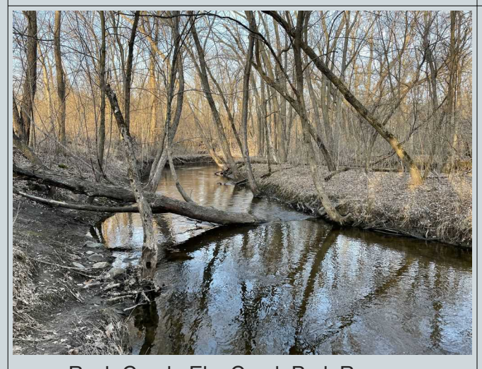
Rush Creek, Elm Creek Park Reserve