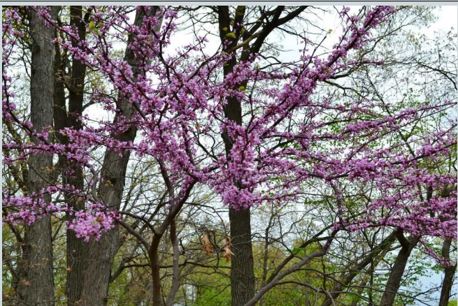
Eastern Redbud, Oakdale Nature Preserve