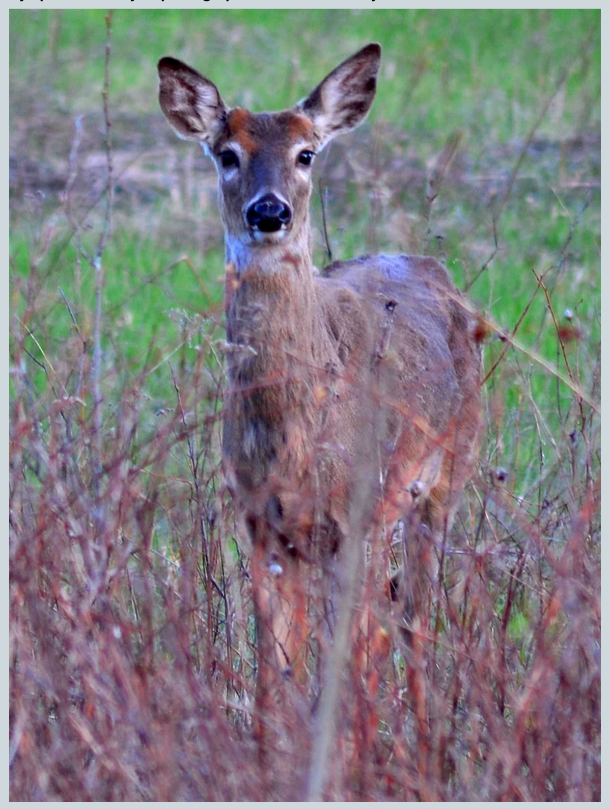
Whitetail "button buck" fawn, Oakdale Nature Preserve

A very special thank you photograph dedicated to everyone who contributed to this article!