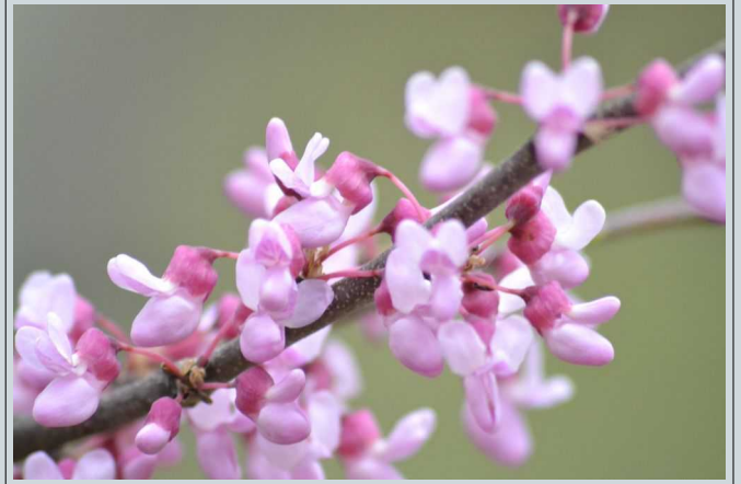
Eastern Redbud, Oakdale Nature Preserve